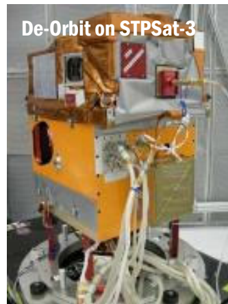
De-Orbit on STPSat-3