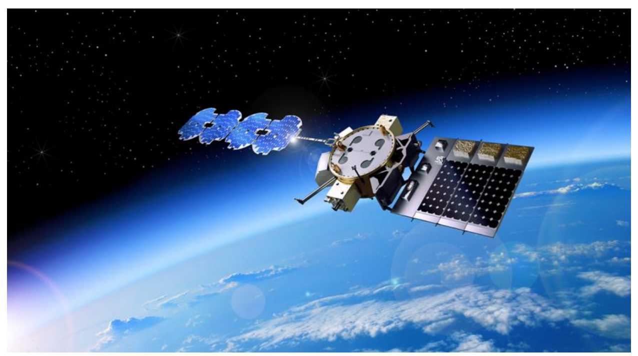
Artist's rendering of the Air Force Research Laboratory's Arachne flight experiment on orbit.

This year, MMA Design will be involved in post-delivery integration support at Northrop Grumman's facility.